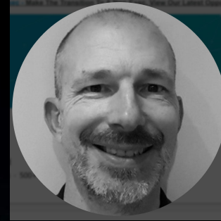
Mike Bean Optical Design